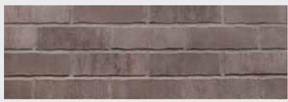
Roman Theatre | Image shows King Size