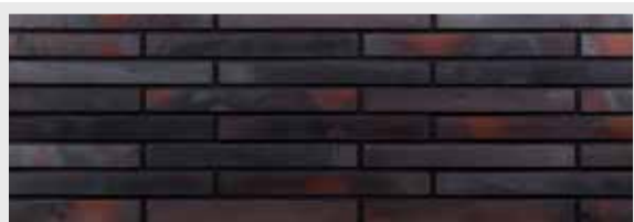
Castle Rock | Image shows Imperial Size